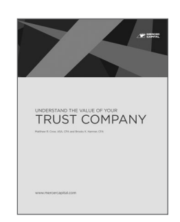
Understand the Value of Your Trust Company

Download these whitepapers and subscribe to the industry quarterlies at www.mercercapital.com