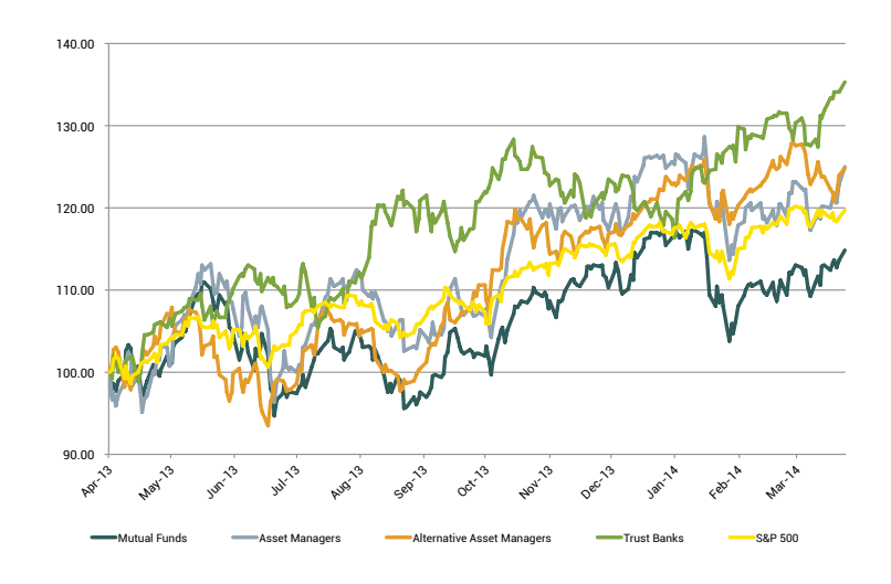
Breakdown by Type